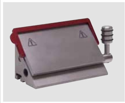
Disposable blade carrier for a low profile blade, Cat. No. 24-3131-00

The disposable blade carrier is suitable for commercially available low profile blades. The blade carrier base is equipped with a lateral movement, thus the whole cutting length of the blade can be used. The clearance angle between cutting edge and specimen is adjustable. In order to perform a coarse adjustment the whole blade carrier can be moved forward or backward on the guide bars. The integrated finger protection helps users to prevent injuries caused by the microtome blade.