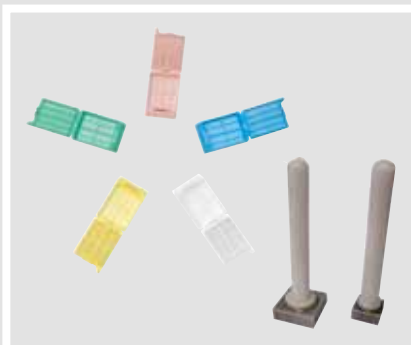
Embedding cassettes with disposable lids Cat. No. 46-1100-00 et seq. Stamp to fix tissue samples Cat. No. 46-0910-00/46-0911-00