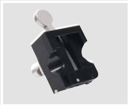
Universal object clamp for standard cassettes, Cat. No. 24-3136-00

As an option a disposable blade carrier for a high profile blade is available on request, Cat. No. 24-3128-00.