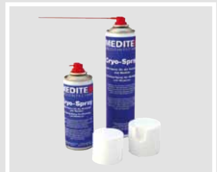
Cryo-Spray 200 cc tin can: Cat. No. 40-0110-00 400 cc tin can: Cat. No. 40-0111-00

08-2010 / Subject to change without prior notice.