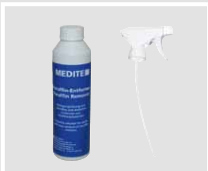
Paraffin Cleaner Bottle of 250 cc (incl. spray pump) Cat. No. 41-5600-00

These products and more are also available from our onlineshop.