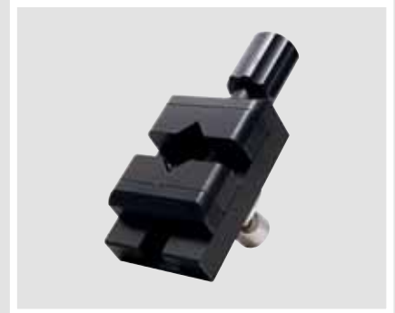
Object clamp with tray for v-shaped specimen, Cat. No. 24-3031-00

The universal object clamp is a quick release system for standard cassettes. By using the adjustable adaptor at the cassette clamp, which is holding the object clamps at the cylinder head, the specimen can be oriented precisely. Object clamps with tray for v-shaped specimen are optional.