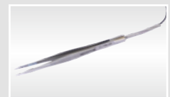
Option: EBP 50

Heated forceps for the direct connection to the dispenser unit.